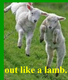
out like a lamb.