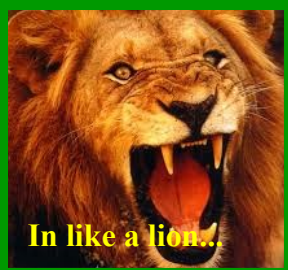
In like a lion!